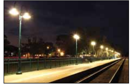
New City LED lights at Amtrak Station.

The news of the project has been featured in many trade magazines including Forbes that liked the project for its smart use of tax dollars. "Smart cities are saving energy and money by replacing inefficient high-pressure sodium (HPS) or high-intensity discharge street lights with light-emitting diodes, or LEDs". The LED bulbs used by Carpinteria promise to last much longer than HPS bulbs thereby reducing maintenance costs. As an added bonus, the LED's do not attract bugs further reducing the costs.